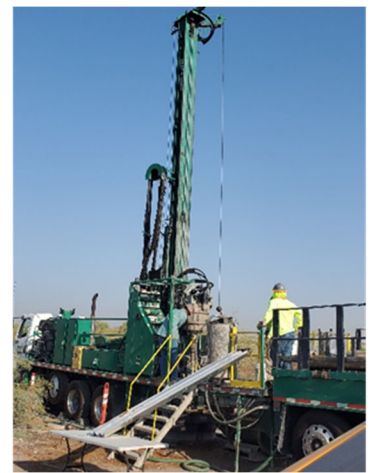
Drilling for Monitoring Well Installation

More than 64,000 analyses were performed on approximately 11,500 samples over nine years. The analyses produced over 480,000 analytical results, ensuring NERT has a comprehensive understanding of the environmental conditions within the study area. The investigations evaluated potential contamination in soil, soil gas, groundwater, surface water, sediment, and possible exposure to key contaminants to ecological receptors (e.g., plants and animals) in the Las Vegas Wash.