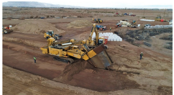
Zero Valent Iron Installation for a NERT Treatability Study

Treatability and Pilot Study Results — NERT is field testing several potential technologies to reduce contamination in soil and groundwater. To date, ten studies have either been completed or are in progress. Preliminary results have shown certain remedial technologies dramatically lower contaminant concentrations and prevent further migration of contaminants. The studies are expected to continue in 2025.